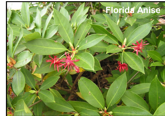
Florida Anise, Illicium floridanum

Landscape Value: Evergreen, very durable. Size / Form: Large shrub, good informal hedge; dwarf forms available; takes heavy pruning. Growth: Moderate / fast. Site Requirements: Any site, wet or dry, sun-shade; salt tolerant. Flower/Fruit: N/A for landscape value.