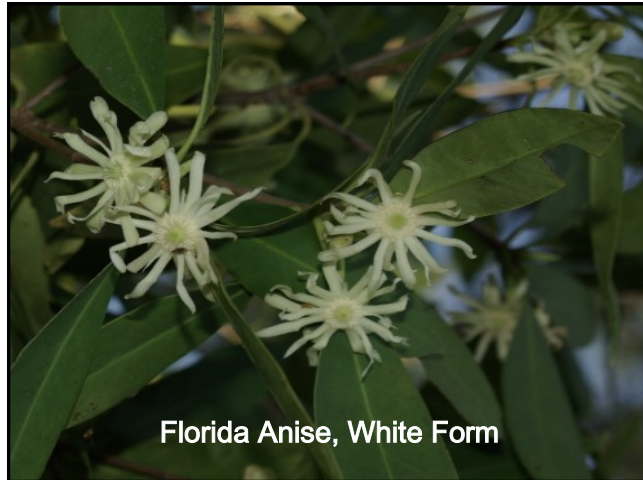
Florida Anise, White Form