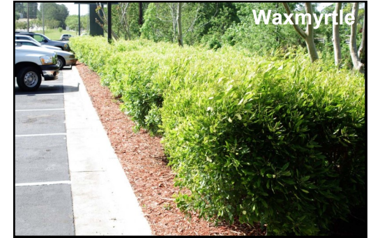
Waxmyrtle; Myrica (Morella) cerifera

Landscape Value: Evergreen, very durable. Size / Form: Large shrub, good informal hedge; dwarf forms available; takes heavy pruning. Growth: Moderate / fast. Site Requirements: Any site, wet or dry, sun-shade; salt tolerant. Flower/Fruit: N/A for landscape value.